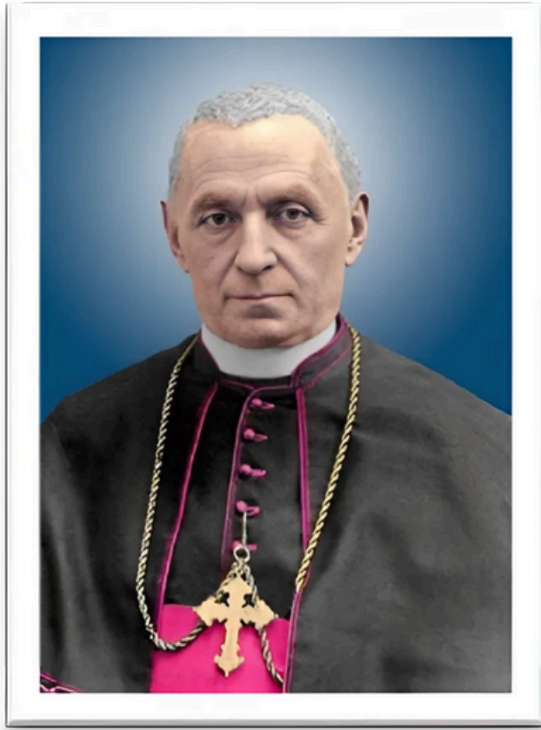
Saint John B. Scalabrini, Father & Patron of the Migrants