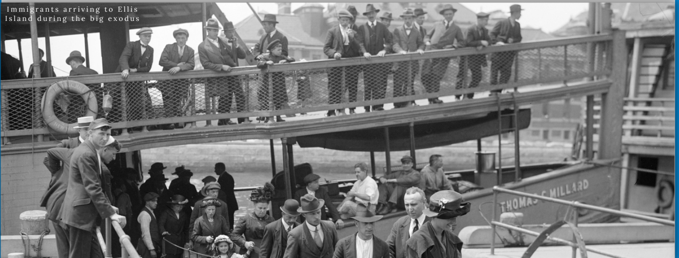
Immigrants arriving to Ellis Island during the big exodus

The criteria of intercultural and inter-communitarian pastoral care of our positions must be pursued and strengthened, together with internal collaboration among the many Scalabrinian institutions (integrated centers) present in the territory and within the Province (see 15 GC 10.1).