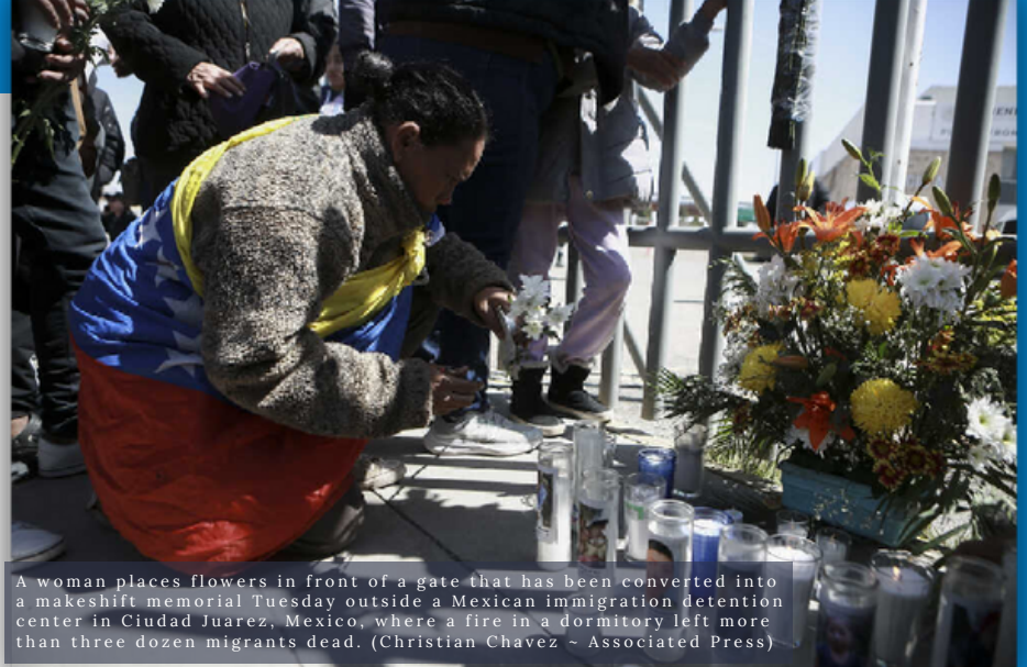
A woman places flowers in front of a gate that has been converted into a makeshift memorial Tuesday outside a Mexican immigration detention center in Ciudad Juárez, Mexico, where a fire in a dormitory left more than three dozen migrants dead.

We strongly condemn the detention of migrants in the so-called "migrant shelters," which are nothing but detention centers. The lack of clarity in immigration policies has been generating despair among migrants for a long time. It is time for governments to ensure that migrants are not subjected to discrimination or exploitation and are provided with adequate