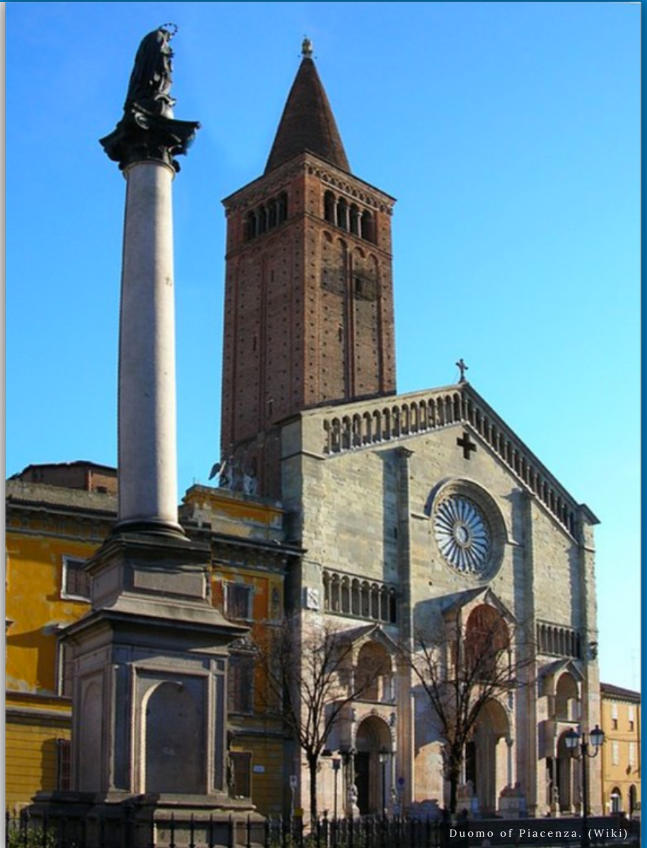
Duomo of Piacenza.

He had the practice of placing documents that involved difficult decisions under the corporal, in physical contact with the Sacrament, sure to be enlightened.