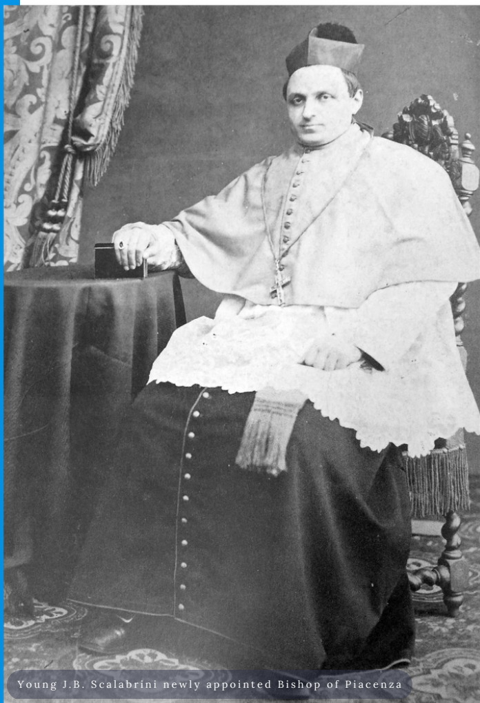
Young J.B. Scalabrini newly appointed Bishop of Piacenza

Jesus to his disciples: "behold, I am with you always, until the end of the age." (Mt 28, 20). Living his faith within the Church, as a young priest, St. Scalabrini knew that the Holy Spirit, who came on Pentecost, is always present in the Church, as the ongoing incarnation of Jesus in human history until the time of its fulfillment. Evident ways in which the Spirit of Jesus Christ is present and active in the Church are the sacraments, especially the Holy Eucharist and the Apostolic Succession.