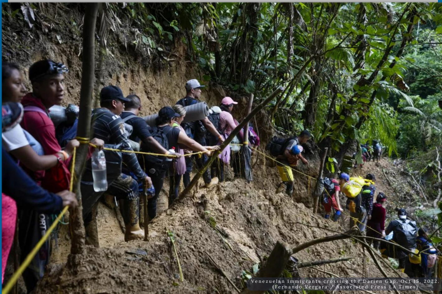
Venezuelan Immigrants crossing the Darien Gap, Oct 15, 2022.

Most Americans are aware of the dangers migrants face when they decide to irregularly cross the US-Mexico border: being kidnapped or even killed by criminal groups dedicated to smuggling and human trafficking, extortion and violence from authorities, getting lost in the desert or lack of enough water or food are some of the perils faced by those who take the risk to reach the US, which cause hundreds of deaths every year.