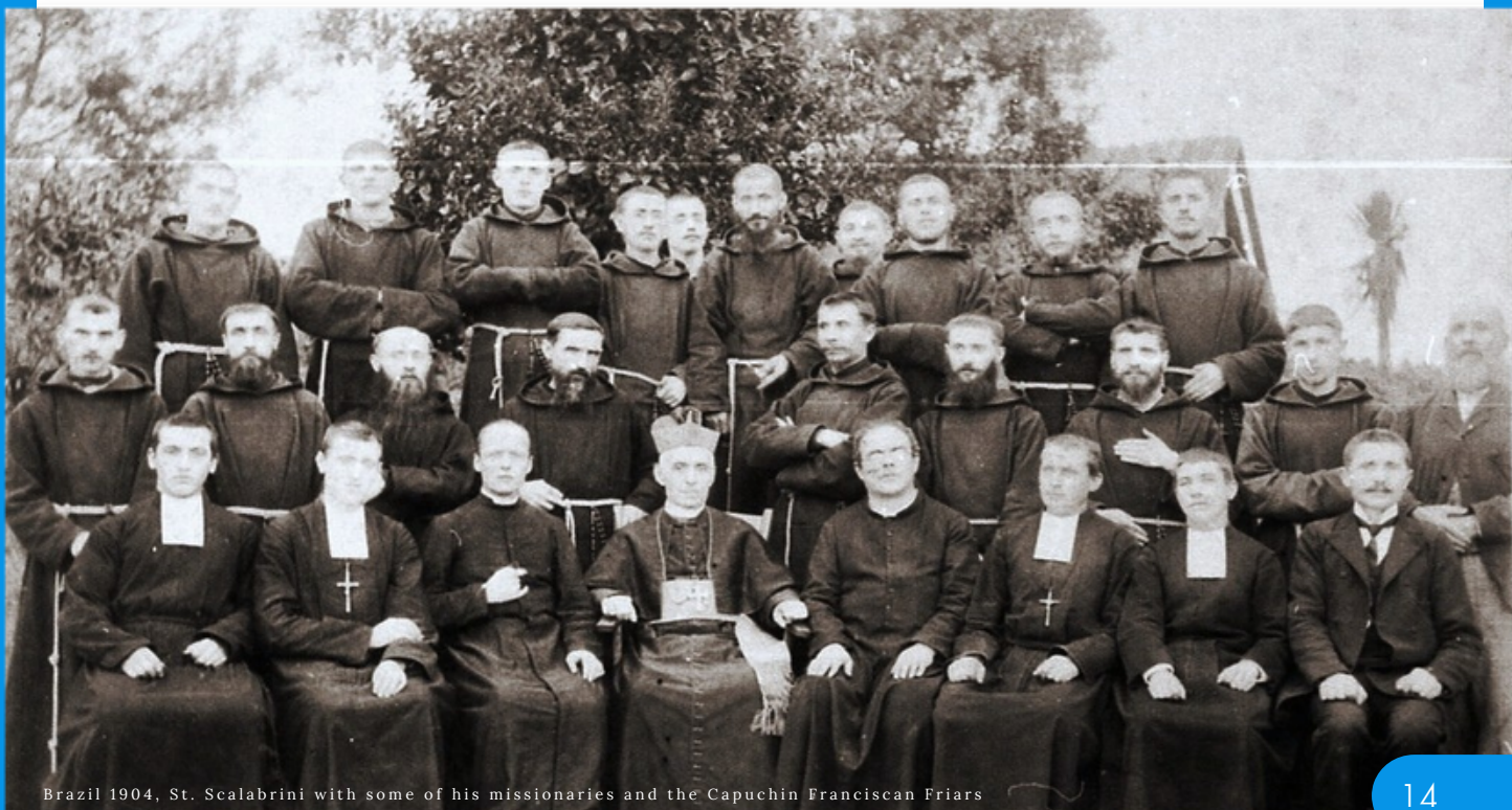
Brazil 1904, St. Scalabrini with some of his missionaries and the Capuchin Franciscan Friars