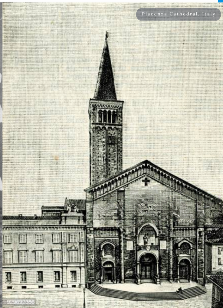
Piacenza Cathedral, Italy