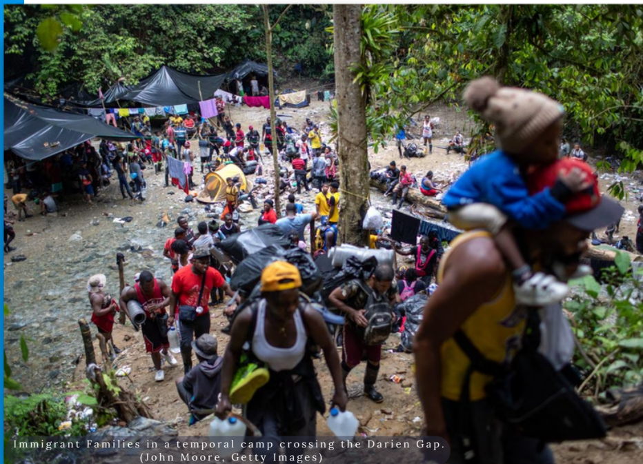
Immigrant Families in a temporal camp crossing the Darien Gap.